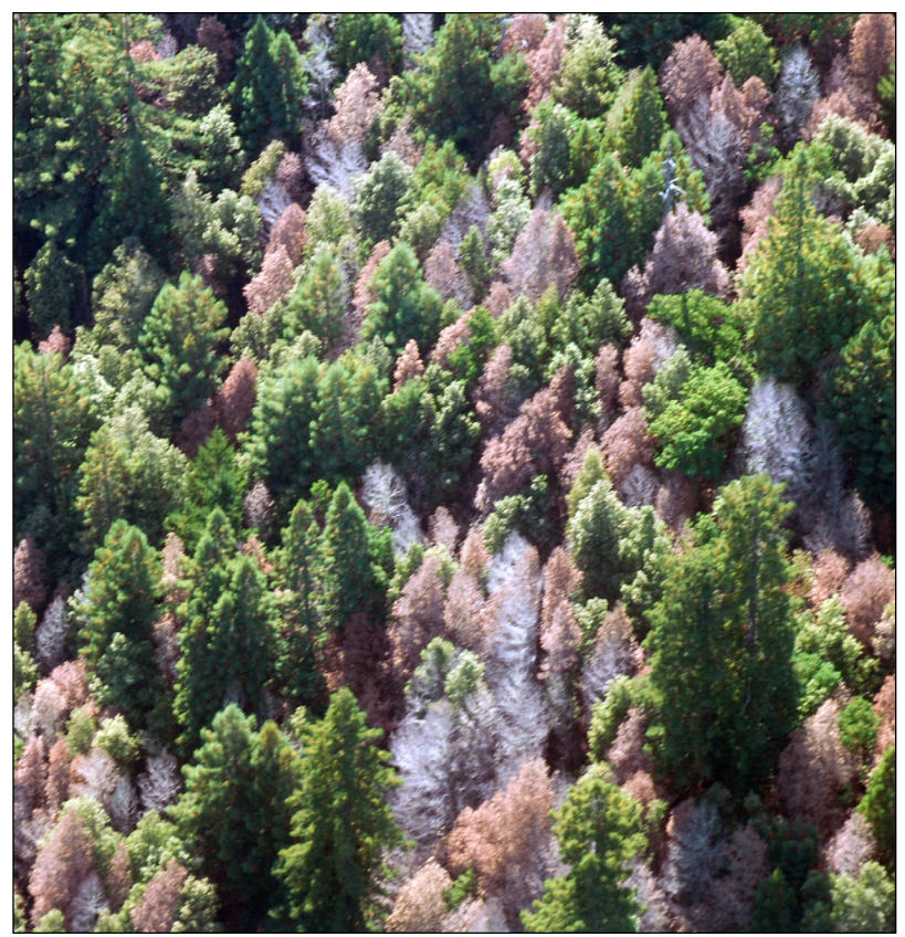
Figure 1: Sudden Oak Death causes mortality of tanoak in Curry County, Oregon.