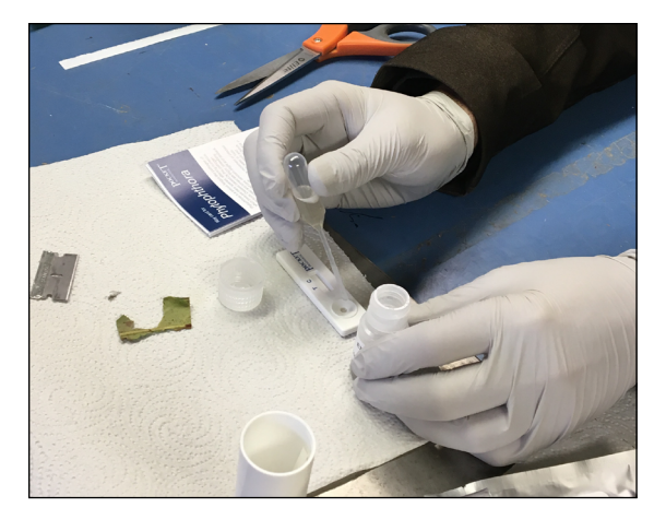
Figure 18. Rapid tests can help rule out infection by the Phytophtora genus. See "Additional resources" (page 12) for more information.