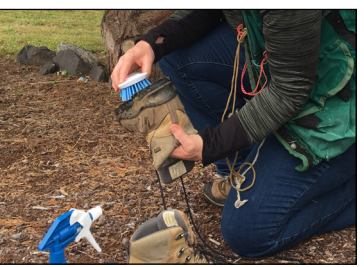
Figure 6. Clean and disinfect equipment with 10% bleach solution.