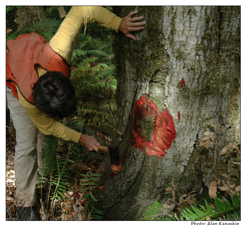
Figure 27. Sudden Oak Death specialist looking for symptoms on tanoak.